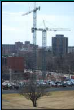
Construction Site in April 2017